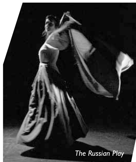
The Russian Play

Tickets to the three performances of Mexico City and The Russian Play and the two performances of April 14, 1912 are available now from the ArtSpring Ticket Centre – 537-2102.