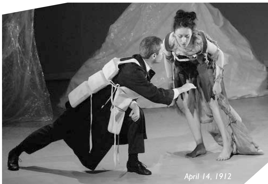
April 14, 1912

PUBLICATIONS MAIL AGREEMENT No. 40022673